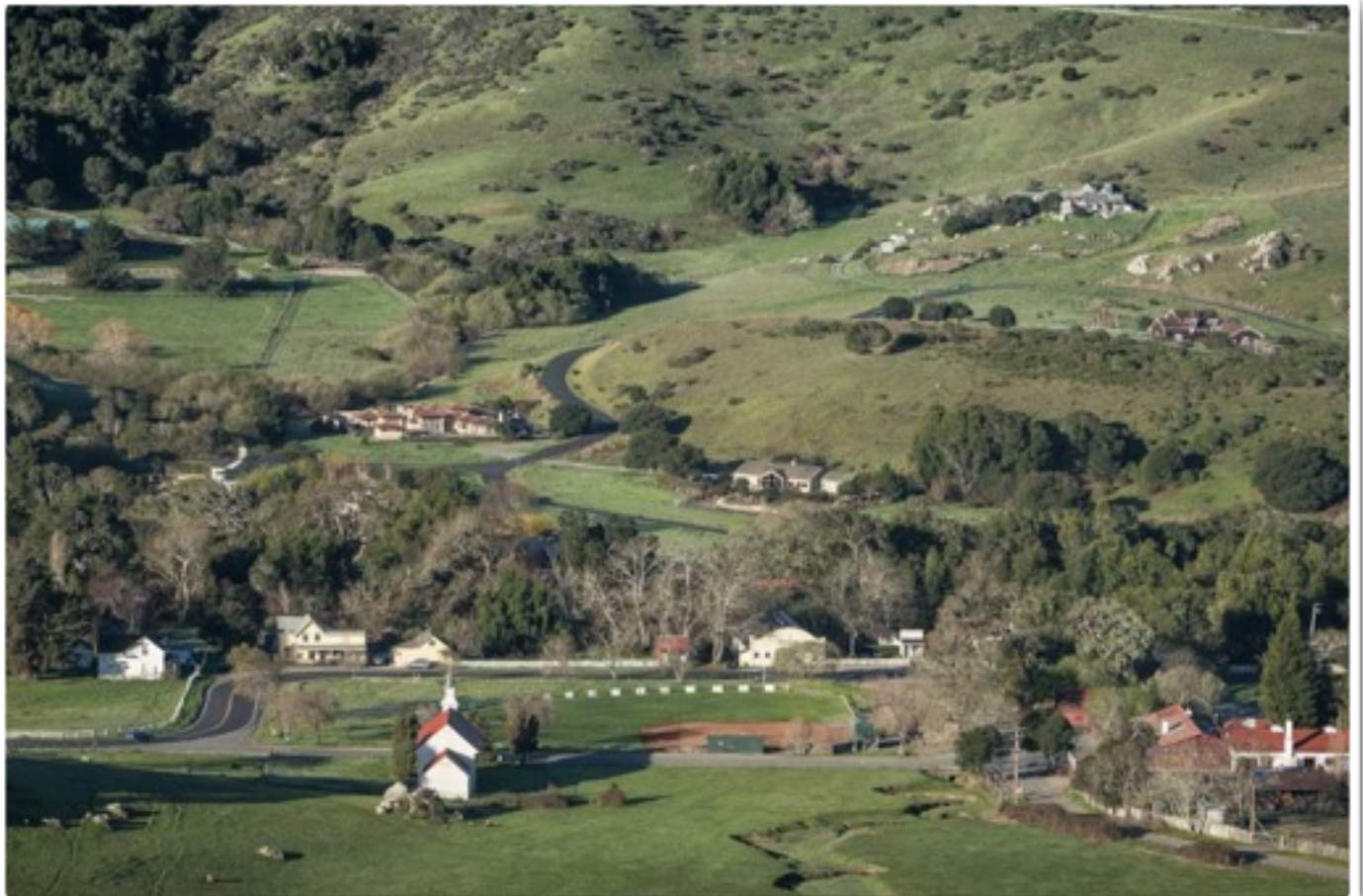
Nicasio, Marin County, CA